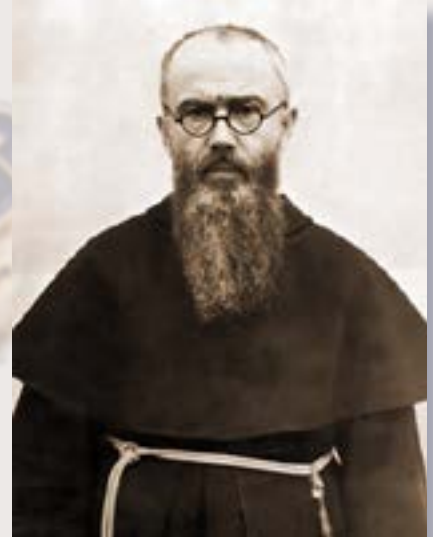
Saint Maximilian Kolbe

Our "Saint of the Month" for September is St. Maximilian Kolbe. Born in Poland in 1894 and ordained a priest (Franciscan Friar) in 1918. He took the name "Maria" in honor of Our Lady. Father Maximilian worked as a missionary throughout Asian before WWII, including founding a Franciscan monastery on the outskirts of Nagasaki which survived the atomic bomb. He returned to Poland and was there when his town was captured by the Nazis. He refused to sign the "Deutsche Volksliste", even though he had German ancestry, which would have saved him from his eventual arrest by the Gestapo. He was sent to the dreaded Auschwitz, where he continued his priestly duties and was severely harassed for doing so. When the camp commander ordered ten random prisoners selected to be starved to death for a recent prison break, Father Maximilian was not one of them. However, he volunteered to take the place of a fellow prisoner, a Catholic man with a wife and family, and was martyred in his place. Saint Maximilian Maria Kolbe, pray for us!